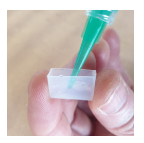
5. Half fill the end cap with silicone adhesive (supplied)