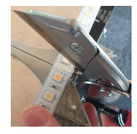
3. Using a pair of scissors cut the strip light to length. Use a single cutting motion in the center of the cut pads.