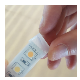
Fit end cap, clean up any excess adhesive. Allow to cure for 24hrs before handling.