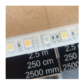
Locate the closest cut point to the length required.

Unreel the striplight onto a flat surface and identify correct end to be cut. Measure and mark out the required length to cut. If installing around curved areas or corners we recommend that the strip light is "offered up" before cutting to ensure correct length has been marked out.