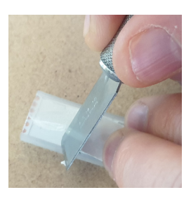
1. At the end to be sealed, peel back 20mm of the adhesive backing and very lightly score the adhesive 10mm from the end using a sharp blade.

It is important that the adhesive backing is properly removed from the end required to be sealed, skipping this step may compromise the watertightness of the assembly and risk voiding warranty.